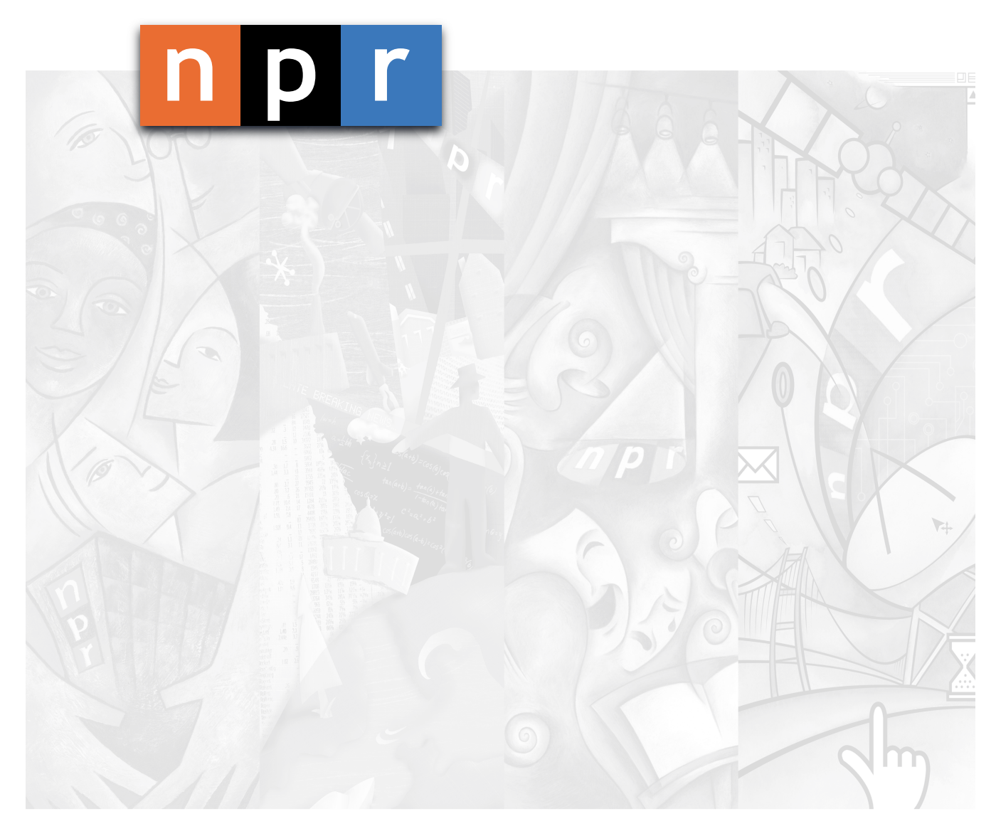
NPR Annual Report | 2001